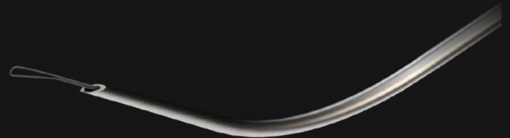
Compatible with Stitch GMReis UPS 2 - 0 -2 suture