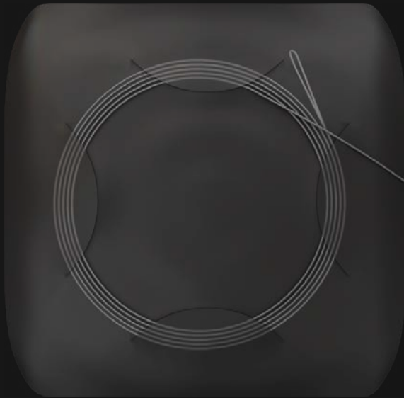
High strength nitinol wire loop Ø0.25 x 560.0 mm.

The variety of models, straight and curved, allows the surgeon to use the Micro EasyPass more suitable for each type of procedure.