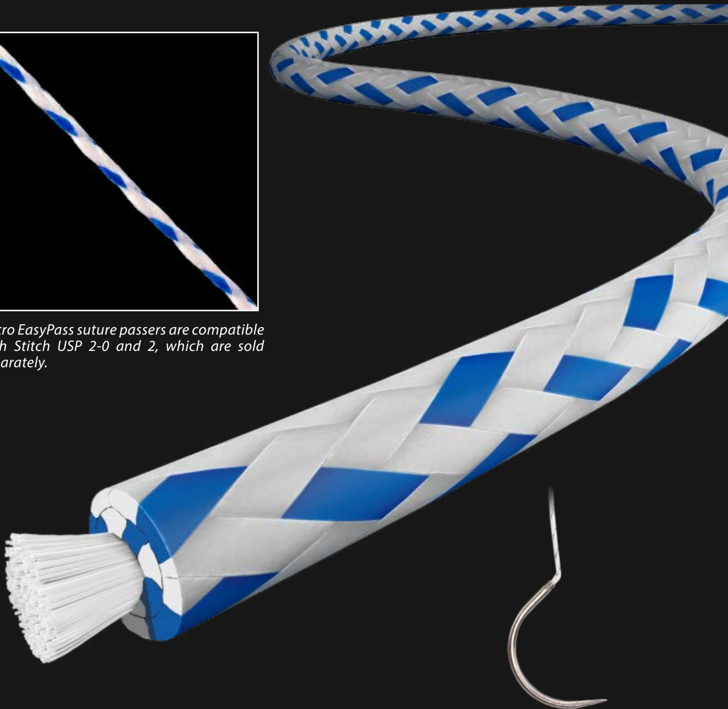
Fig.: All surgical suture and suture tapes are supplied with needle.

Micro EasyPass suture passers are compatible with Stitch USP 2-0 and 2, which are sold separately.