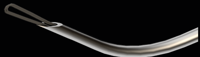
Compatible with Stitch GMReis UPS 2 - 0 -2 suture

Five options: straight and curved (tight, small, large, and extra large)