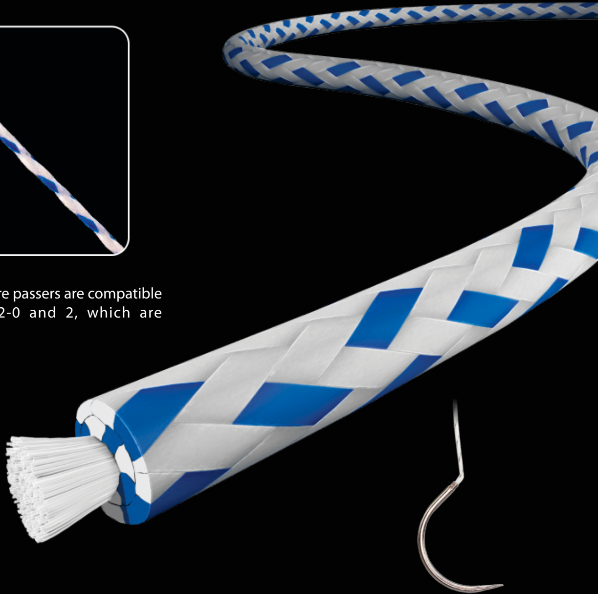
Fig.: All surgical suture and suture tapes are supplied with needle.

Micro EasyPass suture passers are compatible with Stitch USP 2-0 and 2, which are sold separately.