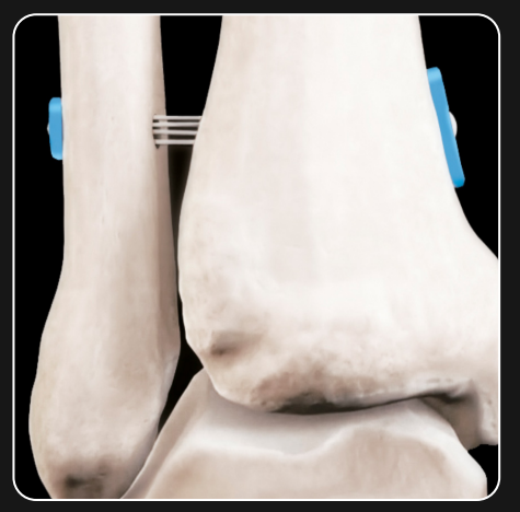
Flexible fixation of syndesmosis with Expert Knotless.