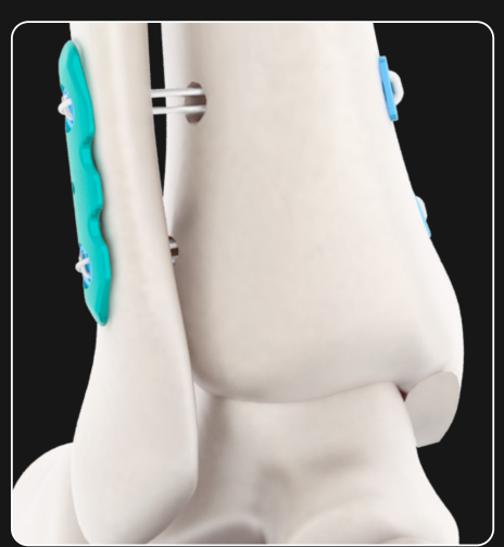
Dual flexible fixation of syndesmosis with Expert Knotless Dual.

Buttress plate expands the contact area of the double flexible fixation system with the fibula.