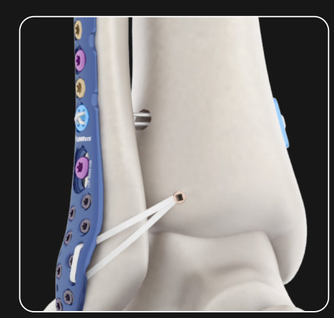
Expert Knotless combined with GMReis Versalock Anatomic Fibula Plate.