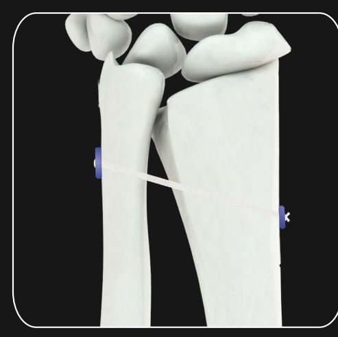
Mini Expert - flexible fixation of the distal radioulnar joint in the treatment of wrist instability.

Suspensoplasty in the treatment of rhizarthrosis with Mini Expert.